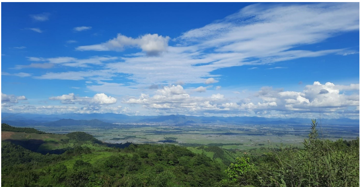
Imphal Valley

In Manipur, India's North-Eastern region which is devoid of much of the industrialisation seen in the rest of the country, catalytic funding through donations, philanthropy or grants, in conjunction with in-kind support to transfer skills, can make a huge difference. Yet, in most instances, the impact of many such initiatives remains limited when sustainability is not factored in during the design process. It is with this in mind that MaolKeki Foundation has focused on a model of entrepreneurship from day one where individuals take ownership for their own success.